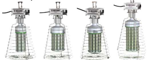
111060LED 111080LED 1110100LED 1110150LED