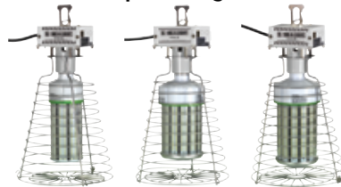
111060NR 111080NR 1110100NR