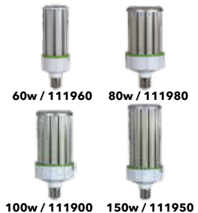
60w / 111960 80w / 111980 100w / 111900 150w / 111950