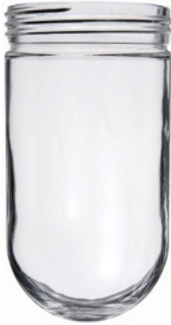
Threaded glass globes fit RAB and other standard Vaporproof fixtures and Lawn Lights Color: Clear Weight: 1.2 lbs