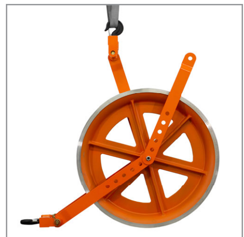
Easily Load & Unload