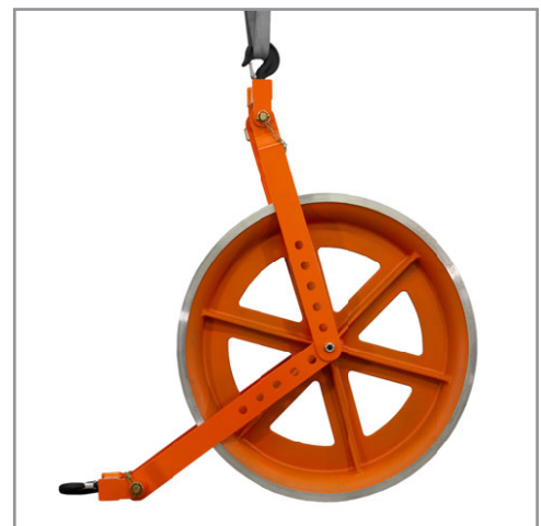
Extra Hook Accessory Available